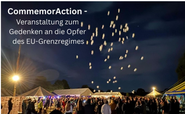
CommemorAction - Veranstaltung zum Gedenken an die Opfer des EU-Grenzregimes