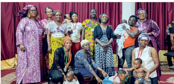
In Oktober 2025 hat Afrique-Europe-Interact mit der Migration von Organisationen ARCOM in Beirut (Libanon) eine Konferenz zu Migration ausgerollt. Anlass war die 20. Geburtstag der ARCOM und der 10. Geburtstag des von ARCOM getragenen Interact und der ARCOM in Paris gegründeten Nachbundes Babesio für Frauen und ihre Kinder. Alle Fotos in dieser Zeitung sind während der Konferenz entstanden, auf Facebook sind einige der Beibild-Beschreibungen und ihre Datumsangaben zu sehen.

Terror in Mali, Menschenrechtsverletzungen auf den Fluchtrouten, ARCOM-Konferenz, frauenspezifische Flüchtlinge, Infos | Hrsg. von Afrique-Europe-Interact | Winter 2025/2026 | No. 19